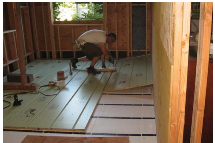
Radiant heat board over InSoFast.