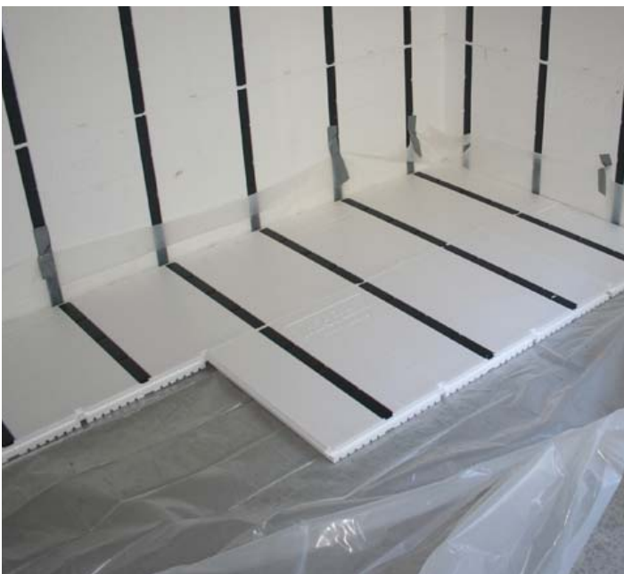
Panels installed over vapor barrier.