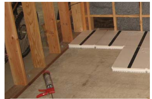
Glue down installation.

Attach InSoFast panels to the concrete floor by installing concrete screws through the studs.