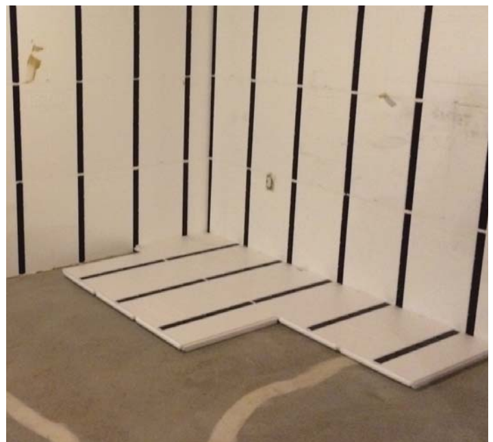
Install panels in a running bond pattern.

Install the InSoFast panels on the wall first. This minimizes the chance of water getting on top of the subflooring in the event the wall leaks.