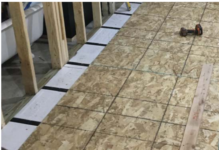
Butting up to existing interior wall.

Install InSoFast panels up to existing interior partition walls. Non-bearing interior partition walls can be framed directly on top of the subfloor with no need for a treated bottom plate.