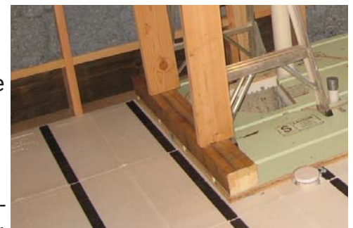
Non-bearing wall framing.

For tile applications, the InSoFast panels are set in a bed of thin set tile adhesive with a notched trowel per manufacturer's instructions.