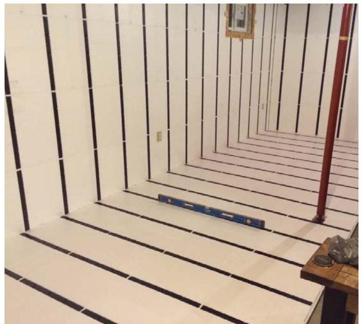
Install InSoFast wall panels first.