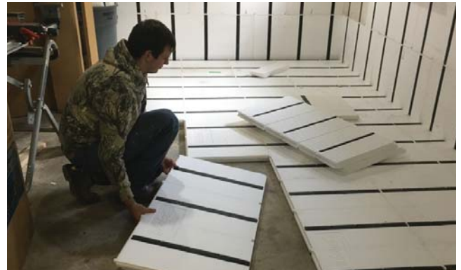
Interlock the panels.

The floating method places the panels directly on the concrete without any adhesive. Interlock the panels together with the tongue and grooved edges in a running bond or staggered pattern.