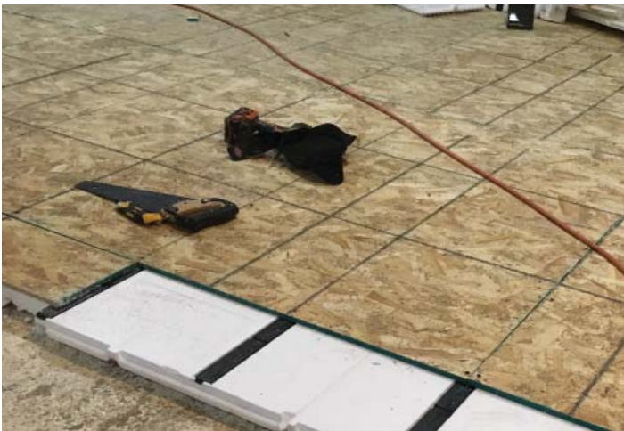
Line up end seam over InSoFast stud.