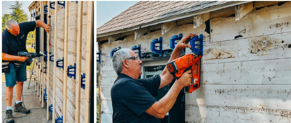
Installing using nails

Attaching furring strips: Use #8 or larger construction screws. 2 screws are required per X-Bracket.