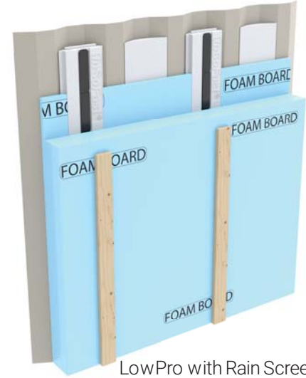
LowPro with Rain Screen