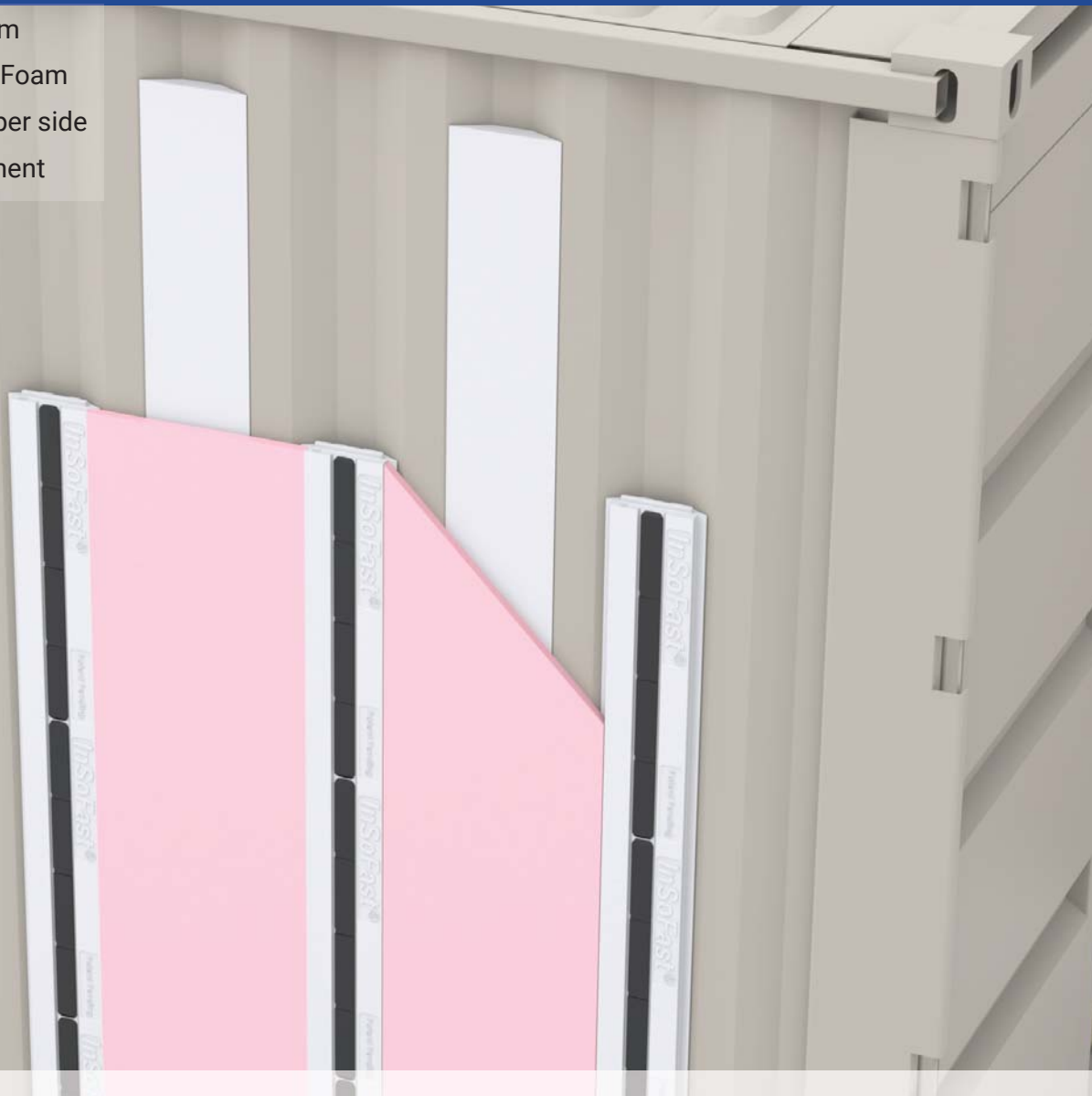
CX LowPro ® Insulated Stud